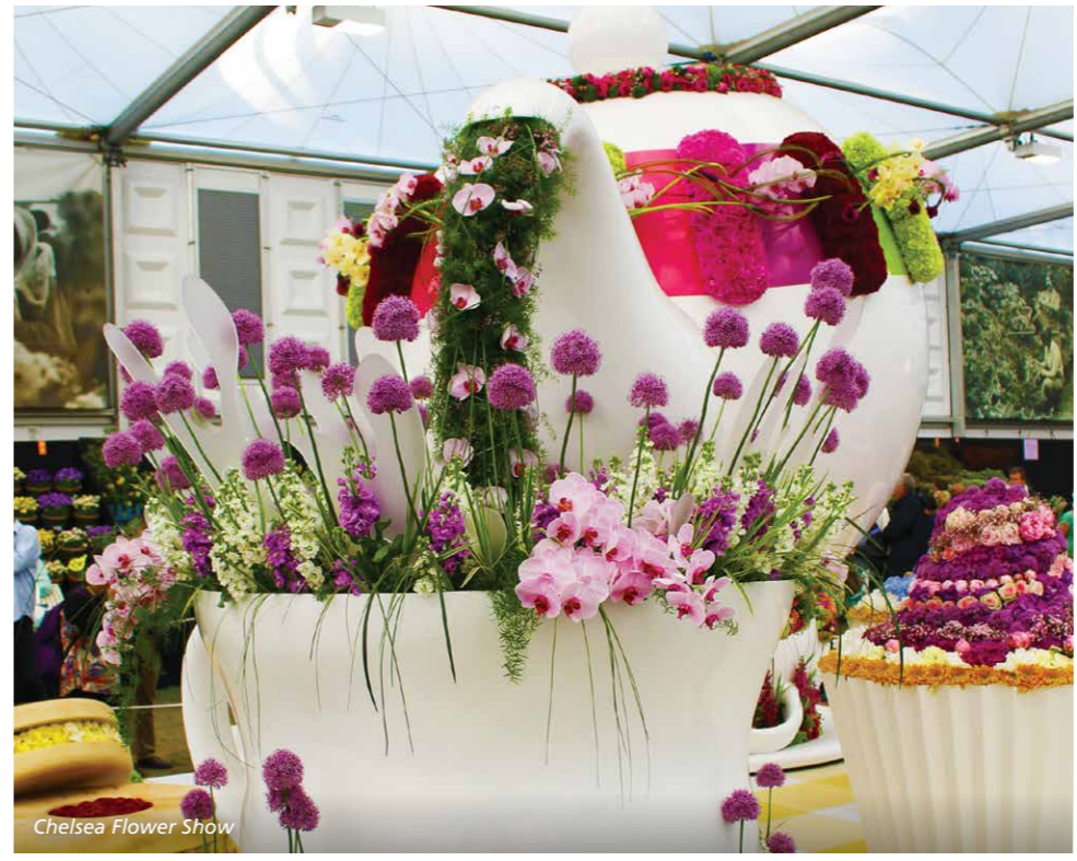
Chelsea Flower Show

DAY 5: TUE 29 MAY 2018 Amsterdam – Bruges Continue to medieval Bruges in Belgium. Stroll along the cobbled streets lined with high gabled houses