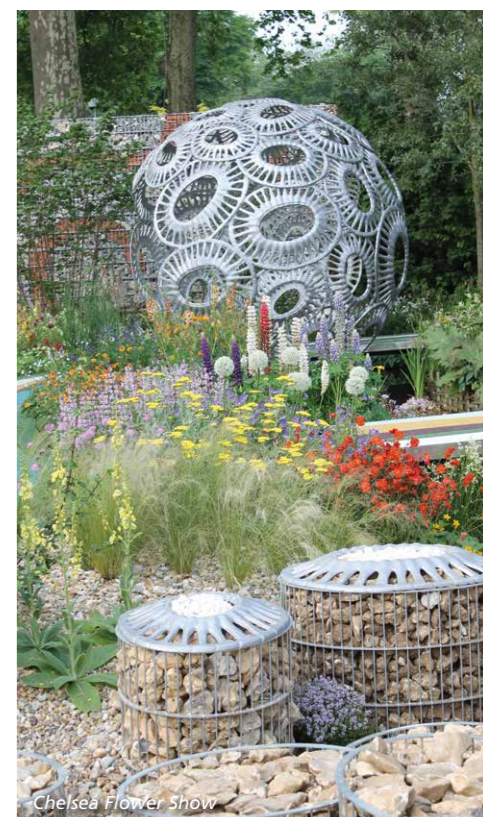
Chelsea Flower Show