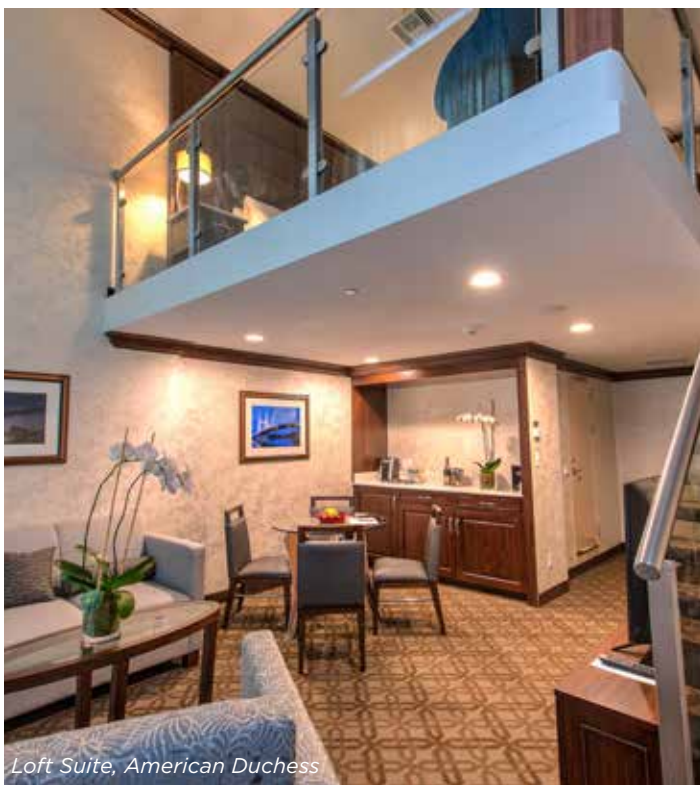
Loft Suite, American Duchess

Each grand vessel boasts a magnificent main dining room, as well as a more casual alternative venue in which you can choose to dine for breakfast, lunch and dinner. Each day of your river cruise presents culinary enlightenment and exquisite fare so delicious that you will yearn for the next meal. All vessels feature 24-hour room service for your comfort and convenience.