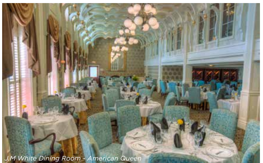
J.M White Dining Room - American Queen