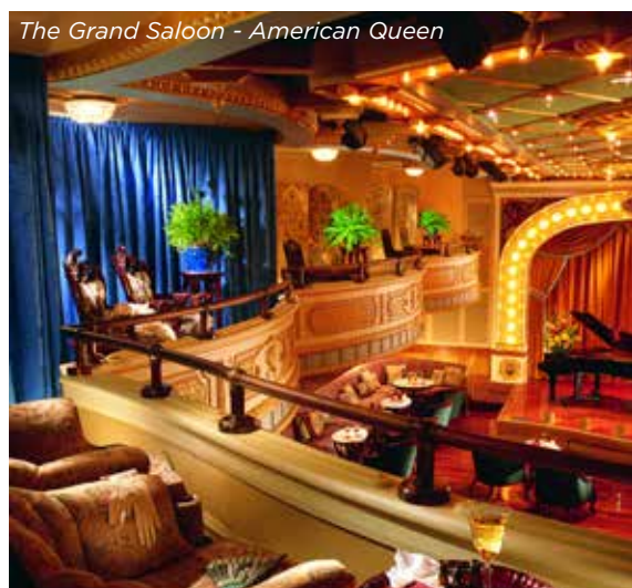
The Grand Saloon - American Queen

The first all-suite paddlewheeler on U.S. rivers, a floating, intimate masterpiece that can carry up to 166 guests through America's heartland. The paddlewheeler features single-seating main dining in the Grand Dining Room, a more casual dining experience at The Rivers Grill, entertainment venues and soaring ceilings. Her suites range from 180 sq. ft to the spacious 550 sq. ft Loft Suites which are unique to the American Duchess.